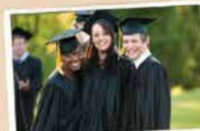
Chad's Graduation - EHS 1996