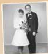
1969 Our Wedding Day