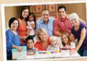
Us and the Grandkids 2000