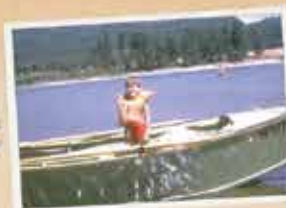
Child in Lake Decatur