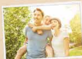
Last Year's Family Reunion at Kiwanis Park