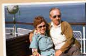
Our New York Trip 1984